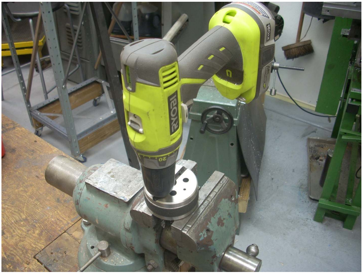
There are plenty of times that I want to drill a hole using my hand held drill. The block provides a degree of alignment that I have trouble reaching by eye.