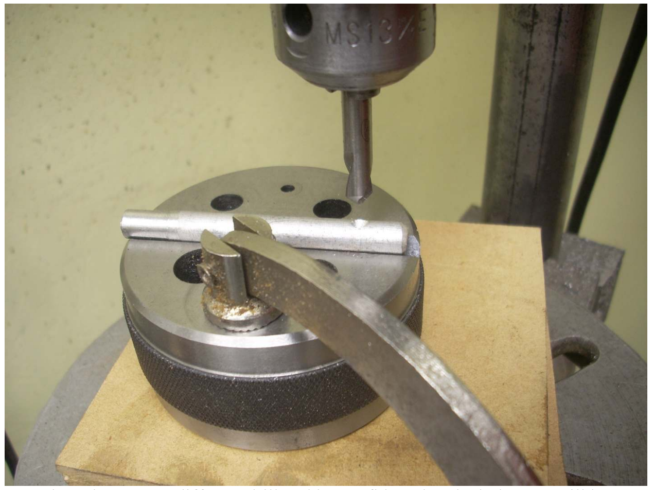
I can then change to a different drill and be confident that the hole I cut will be on the center line of the round stock. I'm using a spotting drill here to cut a cone shaped hole.