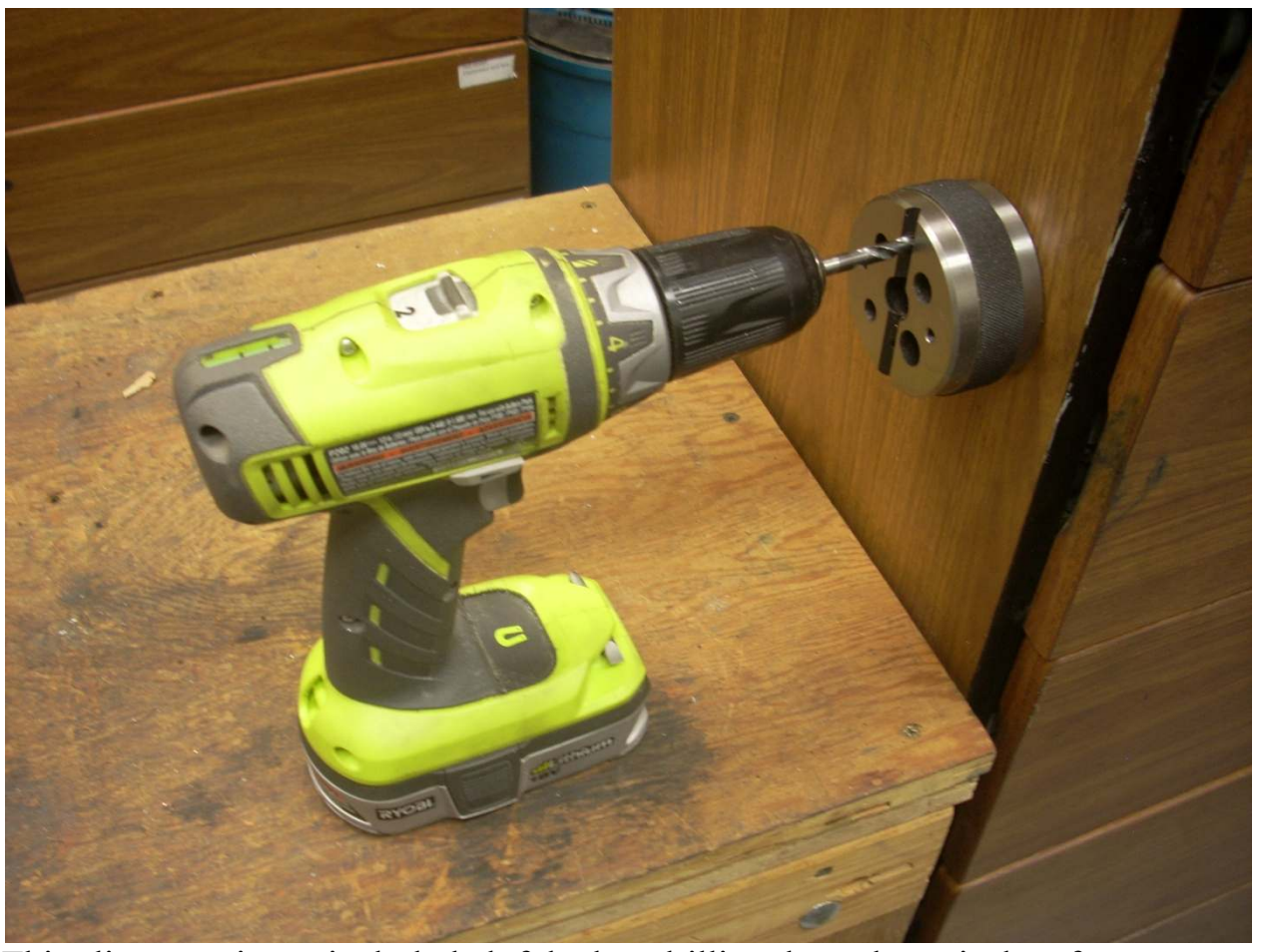
This alignment is particularly helpful when drilling through vertical surfaces or overhead. The knurled perimeter and weight of the bench block give you a solid grip and a good feel.