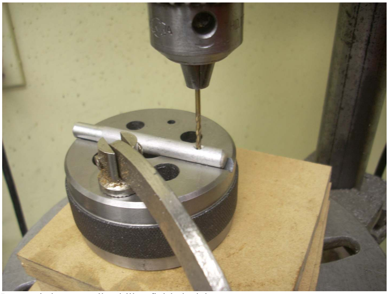
I can switch to a smaller drill to finish the job.

I don't use my bench block every day, but often enough to justify the reasonable price plus space it takes up in my shop. It is also small enough to go into my tool box when I am working outside my shop.