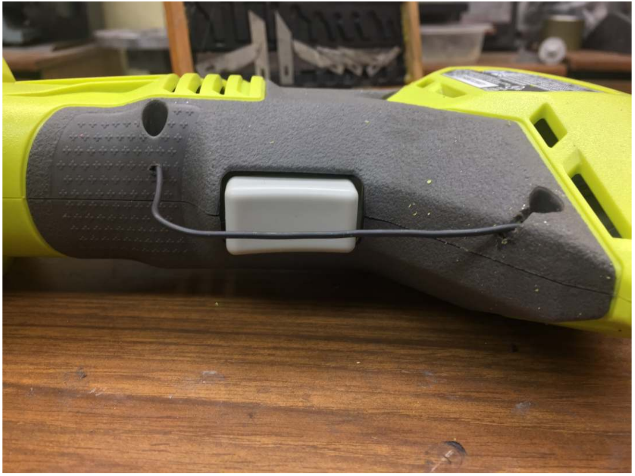
The final step was to bend the wire so it was centered over the trigger.

My initial intension was to carefully remove this wire and use it as a template to make a more substantial guard. But then it occurred to me that this might be good enough. It does guide my fingers away from the trigger and is stiff enough to provide partial support as I pick the compressor up.