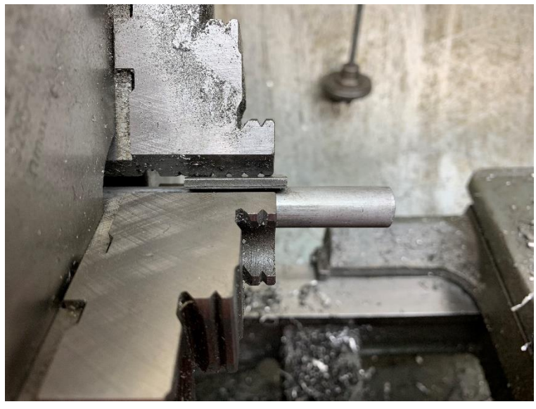
The stock is placed in my 3 jaw chuck with a 0.1" spacer between one jaw and the rod. This packing offsets the rod. The stickout is around <sup>3</sup>/<sub>4</sub> inch.

I started by taking some <sup>1</sup>/<sub>2</sub> inch aluminum rod and cutting off about 1-<sup>1</sup>/<sub>4</sub> inches.