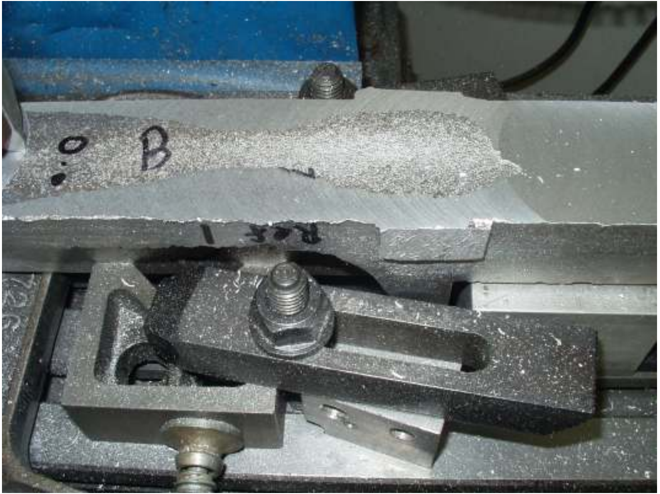
On the second 25 thou deep cut you can still see signs of shrinkage.